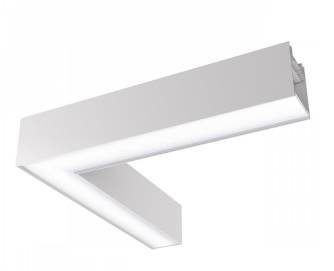
Direct, Pod, Corner, White

Direct, Hexaprism, Organic Response, White