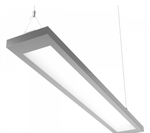
Selene 2 Suspended