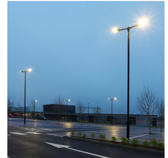
Tubular column with black finish and twin heads